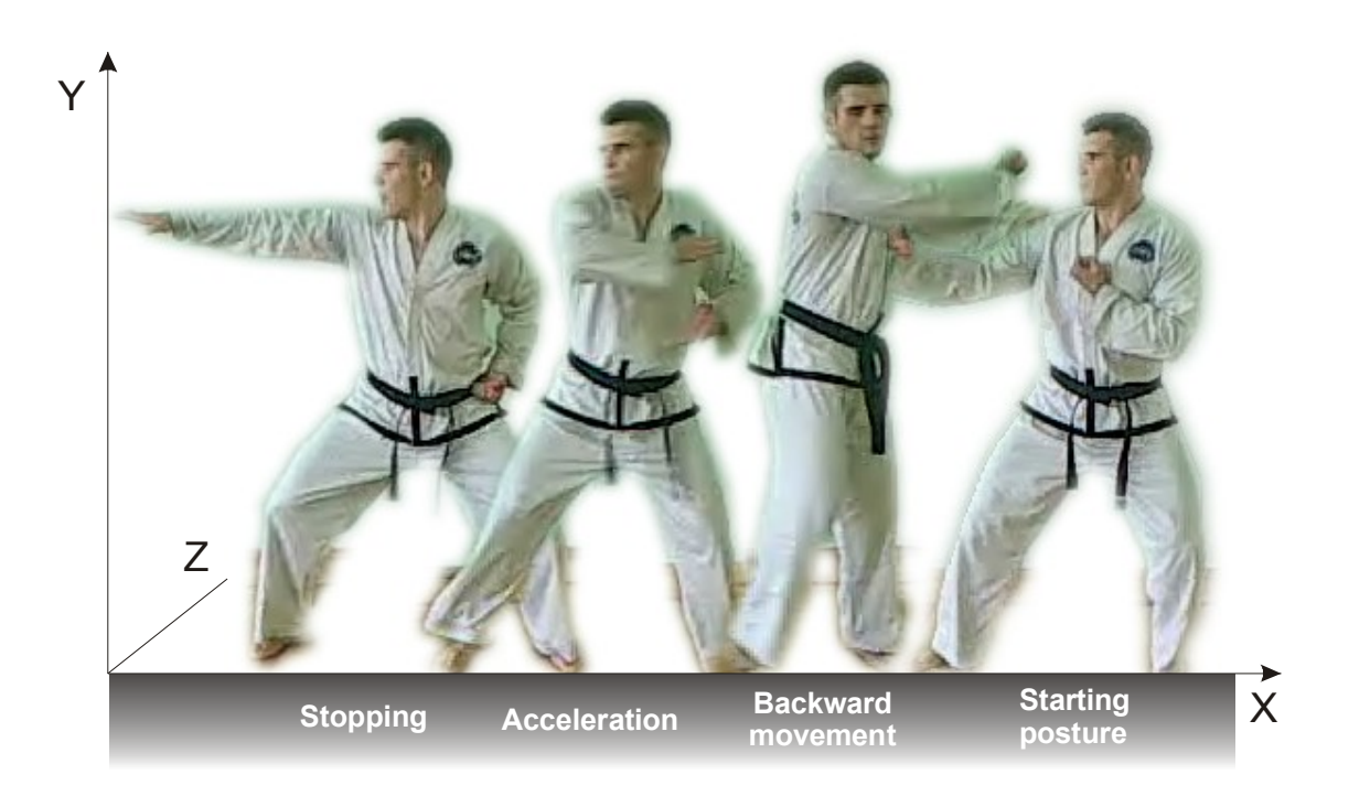
Figure 1. Structure of the knife-hand strike used in power breaking.

Stopping : the moment of reaching the maximum velocity is immediately followed by sudden and dramatic braking of the fist, which is supposed to stabilize the upper limb and the rest of the body.