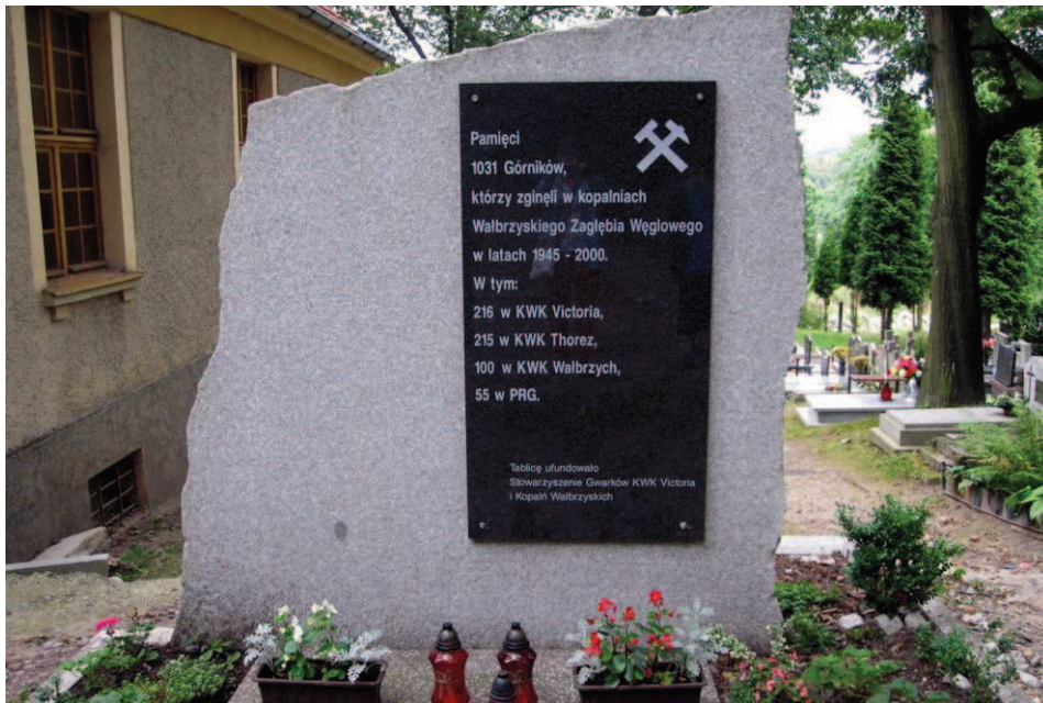
Pic. 1. Memorial in honor of miners tragically deceased in Wałbrzych mines

such as “Dziewięciu z Wujka [Nine from the Wujek Mine]” in Katowice or “Poległych Górników [Fallen Miners]” in Zabrze.