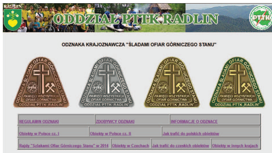
Pic. 3. “Śladami Ofiar Górniczego Stanu” badges

An additional element encouraging potential tourists to make the effort and visit mining memorials is the possibility of receiving a “Śladami Ofiar Górniczego Stanu” sightseeing badge (a bronze, silver, gold, or honorary one) from the Board of the Radlin Branch of the PTTK. This badge can be awarded to individuals or groups (from the age of seven) engaged in any form of tourism in the country or abroad. The necessary condition is to document the stay in the form of photographs, in which the memorial with the person applying for the badge should be visible. Each memorial is awarded points according to the applicable terms and conditions (sections/tombs/collective graves of more than two victims – 5 points; tombs/graves with one or two victims per one – 2 points; other sites/objects of remembrance, such as plaques, statues, monuments, obelisks, paintings, sculptures, etc. – 2 points; objects outside the country—1 point extra). A few months after the badge was established, it had been awarded to more than 60 people 25 .