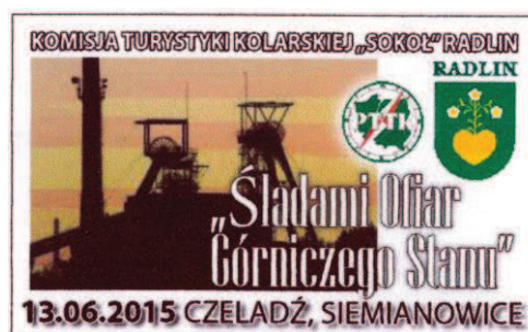
Pic. 4. Commemorative ticket for race participants

Yet another possibility of discovering interesting memorials is offered by the Cycling Tourism Commission “Sokół” during regular cycling races organized by it. Since 2014, five such races have taken place in different locations in Poland and the Czech Republic (the 1st: near Radlin and Wodzisław; the 2nd: in the area of Katowice and Mikołów; the 3rd: in the area of Karvina, Orlova, Ostrava, Bohumín; the 4th: in the city of Ruda Śląska; the 5th: in cities Czeladź-Siemianowice).