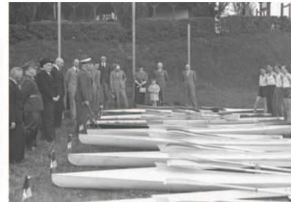
Figure 4. Members of the Czechoslovak YMCA with canoes and members of the Polish YMCA with kayaks<sup>59</sup>

Yachting is another important YMCA water sport and the conveniently located Gdynia YMCA had excellent conditions for it<sup>60</sup>. Members of the Czechoslovak YMCA were also introduced to this sport, the Prague association running a summer camp on Staňkovský Pond in Vlčice<sup>61</sup>.