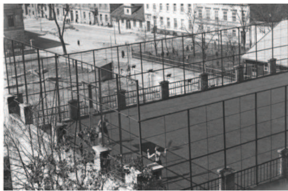
Figure 2. A view of the sports ground on the roof of the YMCA building in Prague and Cracow<sup>28</sup>

However, if the populations of the towns and cities in question were to be taken into account, the strongest local association would clearly have been in Cracow, with its population of around 220 thousand in 1931. Czechoslovak groups had lower membership numbers than Polish groups. Unfortunately, no details were available regarding the membership size of the Prague group, which must have been one of Czechoslovakia's largest. The Bratislava YMCA reported just over 510 members in 1927, Banská Bystrica 215 and České Budějovice fewer than 140<sup>29</sup>. If the populations of the cities in question were taken again into account, the strongest Czechoslovak YMCA would have been located in Banská Bystrica, which reported a population of only eleven thousand in 1930<sup>30</sup>.