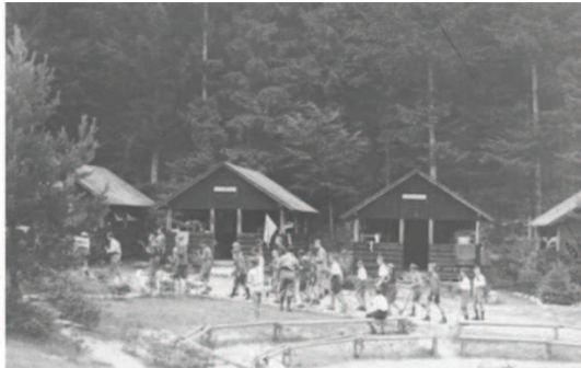
Figure 6. View of the Masaryk Camp on the River Sázava and the Beskid Camp outside the town of Mszana Dolna<sup>84</sup>

At that time, summer camps in both Czechoslovakia and Poland were mostly run on a seasonal basis. However, both national YMCAs finally began to transform their camps into permanent ones. The YMCA thus greatly contributed to introducing the tradition of permanent summer camps<sup>85</sup> in both Czechoslovakia and Poland (see Figure 6)<sup>86</sup>.