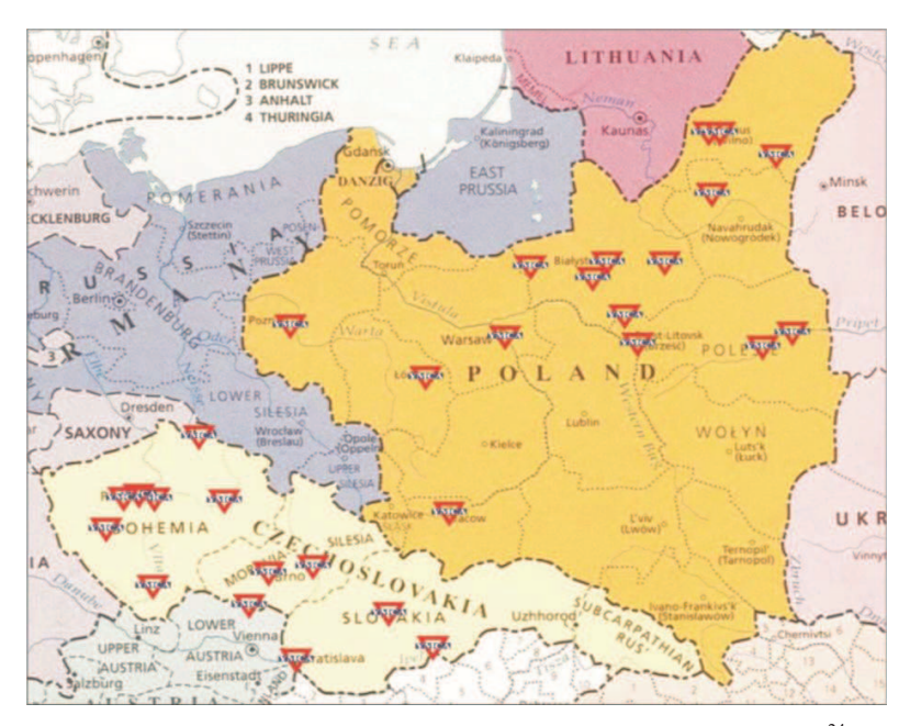
Figure 1. A 1935 map showing Czechoslovak and Polish YMCAs in the early 1920s<sup>24</sup>

Poland, local groups were faced with the problem of not having sites of their own for their activities and having to share premises with others. It was not until 1926<sup>19</sup> that the Polish YMCA established its first office in Cracow, following on in Warsaw – 1932<sup>20</sup>, Poznań<sup>21</sup> and Lódź – 1935<sup>22</sup>. Another significant centre of the Polish YMCA, seated in Gdynia, did not manage to finish building its own premises due to war events. Smaller local associations located in the towns of Ostrolęka, Siedlec, Baranowicze, Brześć n. Bugiem, Białystok, Czeremcha, Jeziory, Lida, Lapy, Łunieniec, Mołodeczno, Nowowilejka, Pińsk, Wilno and Wołkowysk<sup>23</sup> (see Figure 1) did not have their own premises and their activity was mainly conducted in rented premises. Consequently, their physical education and sports activities were not as significant as in the Czechoslovak associations, which predominantly had premises of their own.