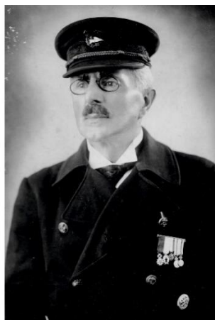
Josef Rössler-Ořovský as a sports official at a later age 65