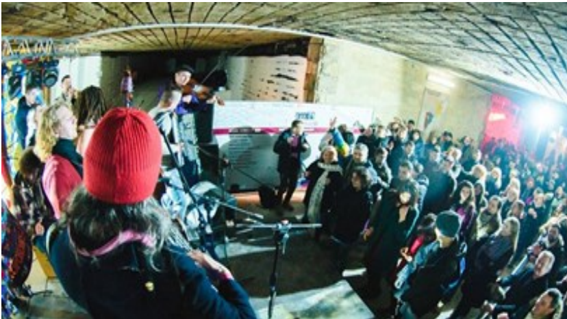
Figure 5. Underland Wine & Music Fest