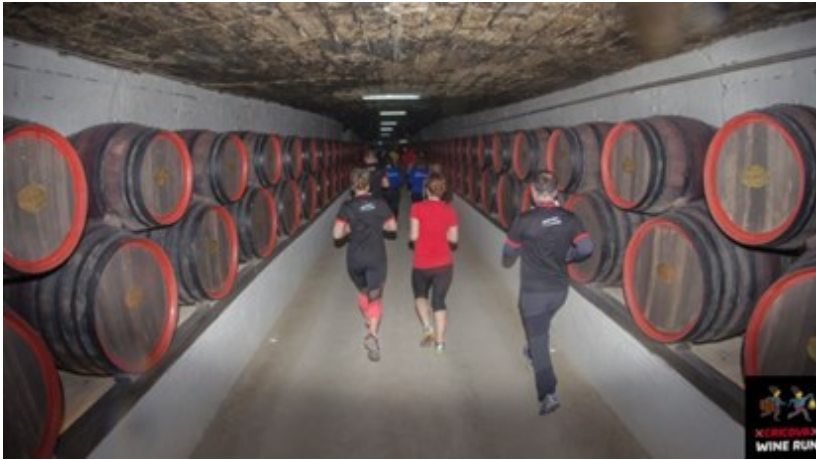
Figure 4. Cricova Wine Run