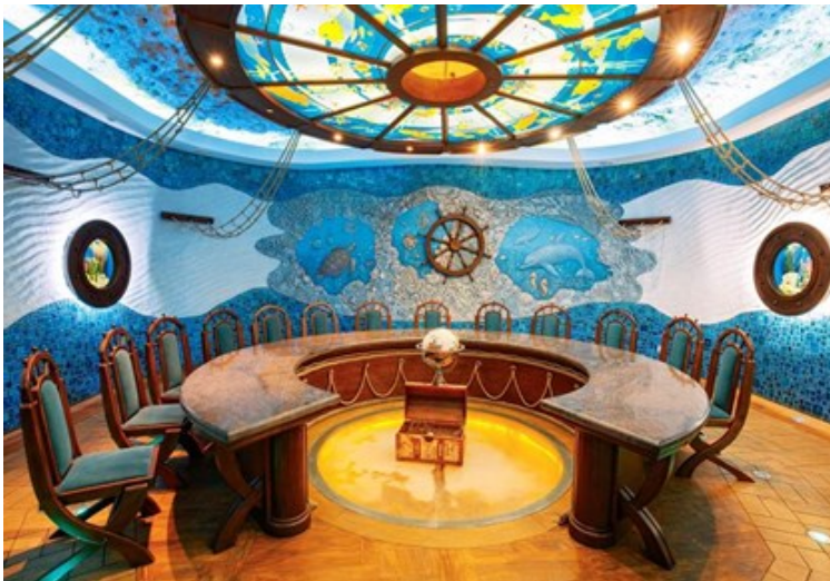
Figure 2. The Bottom of the Sea Room

V. The Room Casa Mare – the place that bears the name of the most beautiful room of a traditional house in the rural area of Moldova (Figure 3). The room is decorated with oak furniture and national motifs. The rustic atmosphere predominates in this room due to the wooden ceiling with beams, which creates the impression of antiquity.