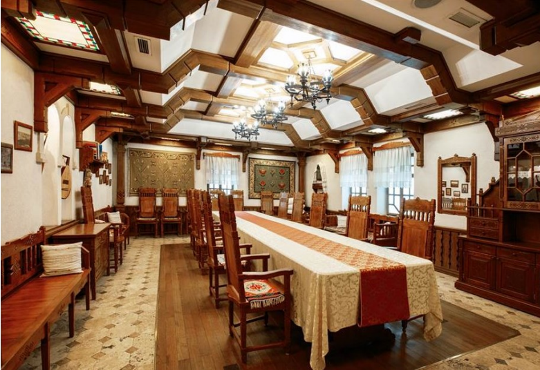
Figure 3. The Room Casa Mare