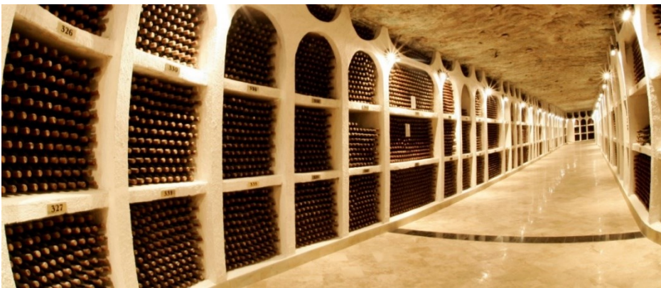
Figure 1. The Underground Complex

Though being located under the whole town of Cricova, the galleries represent a real underground town with streets, traffic lights and road signs. The streets are named according to the name of the wine that is kept in the adjacent niches: Cabernet, Dionis, Feteasca, Aligote, Sauvignon, etc.