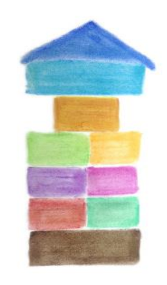
Fig. 2 Model FF