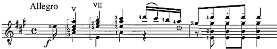
Example 1. Allegro , bars 1–2: part of theme I.