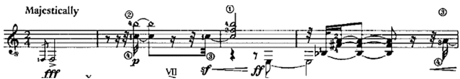
Example 11. Gloucester : part of theme I. Source: H.W. Henze, Royal Winter Music , B. Schott's Söhne, Berlin 1976.

The work in question is composed of six parts, each entitled after a literary character. The first movement, Gloucester , has the form of a sonata allegro. Theme I is filled with dissonant harmonies and contrasting colours (timbres change from sul tasto to sul ponticello ). In terms of dynamics, fff is predominant while the rhythmic layer contains frequent syncopations, thirty-second grace notes, and sharp, punctuated rhythm (example 11).