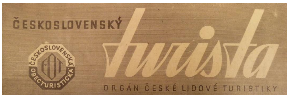
Figure 2. Header of the magazine Czechoslovak Tourist

In August 1946, the ČsOT sent an application to the Central National Council of the Capital City of Prague for permission to establish a publishing house, printing house and bookstore. In effect, one of the objectives of the ČsOT was to publish specialised literature, magazines, postcards, maps, information and promotional tourist leaflets and own literature focused on natural history. The ČsOT intended to use the profits for broadening of knowledge of the Czechoslovak Republic and specialised study, exactly as was prescribed by the Statutes of the organisation. 32 Nonetheless, on 30 May 1947, the Board of the Central National Council of the Capital City of Prague decided to reject the application at its meeting, stating that