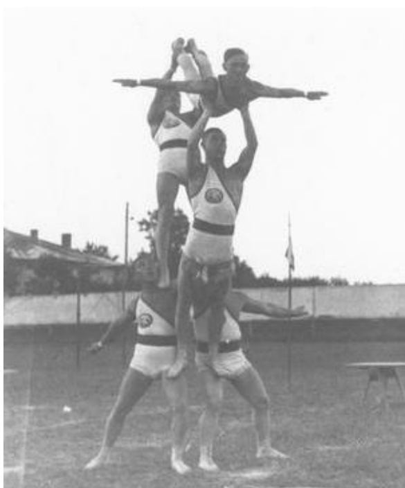
Photo 3. 50 th Anniversary of the Gymnastic Society “Sokół” in Ternopil; Rally of Region VI (Ternopil) GS “Sokół” in Ternopil; Gymnastics shows by Sokół members

we extend our wishes to the Honorable Benefactor and the board of the Mikulińce nest so that the Mikulińce “Sokół” centre may soon be built and completed. 47