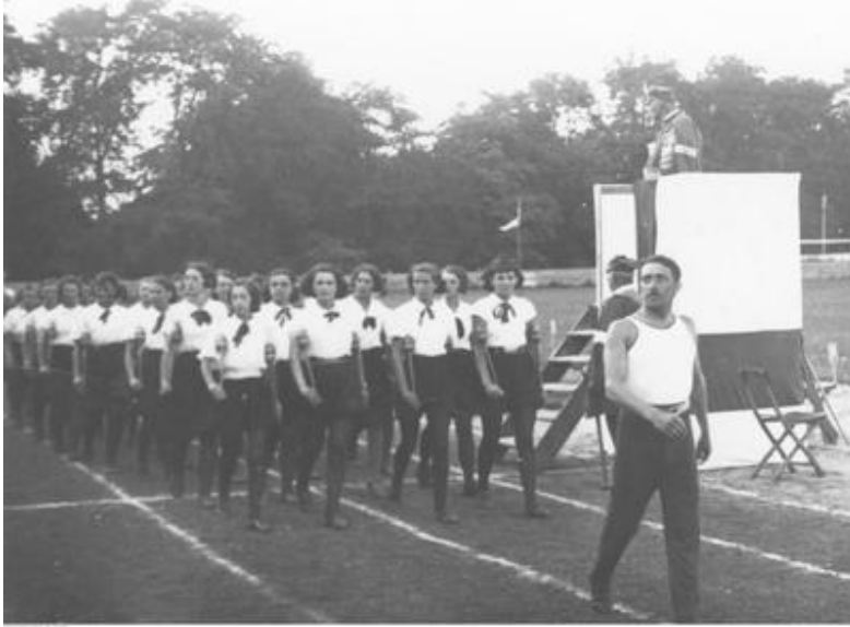
Photo 1. 50 th Anniversary of the Gymnastic Society “Sokół” in Ternopil; Rally of Region VI (Ternopil) GS “Sokół” in Ternopil; March of the female team of the Ternopil nest across the sports field (July 1936)