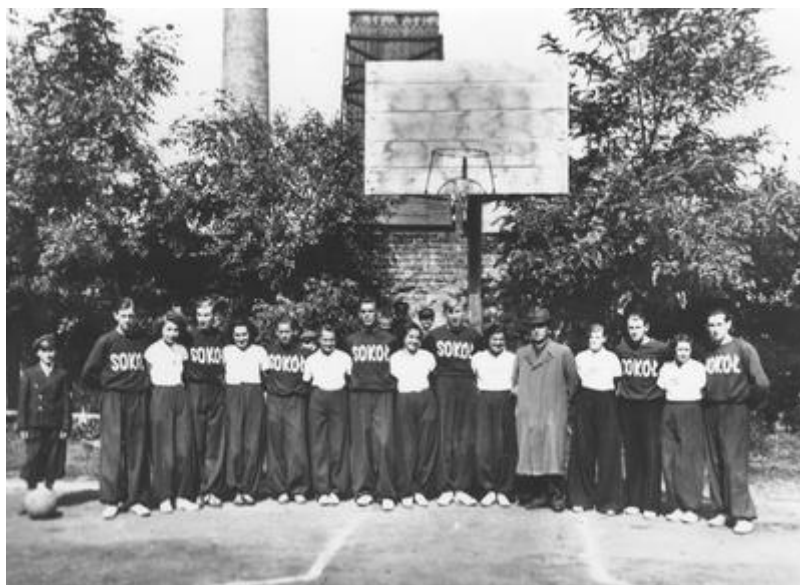
Photo 5. Gymnastic Society "Sokół" in Ternopil. Members of the sports games team (1936)