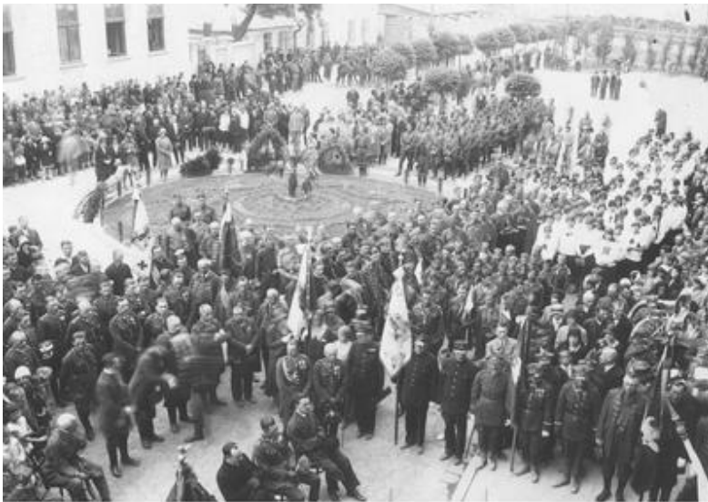
Photo 2. Rally of Region VI (Ternopil) GS “Sokół” in Złoczów on June 22, 1930

Source: National Digital Archive (NAC); ref. 1-P-1140-1.